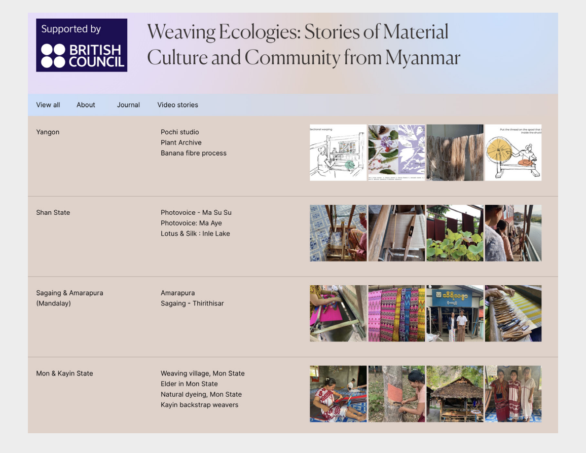
Figure 7: Opening page of the digital archive for 'Weaving Ecologies: Stories of Material Culture and Community from Myanmar', created under a Creative Commons cco 1.0 Universal license. Source: Boyer, 2024a. Credit: Digital archive by Britta Boyer.

This paper concludes with a note on how the resulting archive embodies the rebellion and vision of the feminist project through the translatable methodology of the Visitor's Hut. Remote visiting becomes the ultimate act of hope by accommodating the struggle and recentering the perspectives of marginalized weaving communities, amplifying their voices so that their stories can be thought and felt beyond the dominant narratives of civil unrest and armed conflict. It also moves