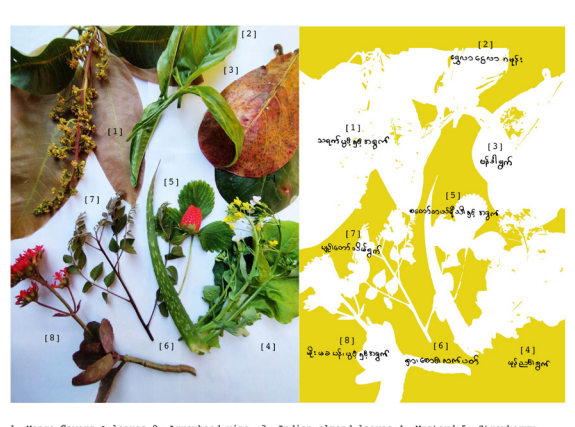
Mango flowers & leaves 2. Arrowhead vine 3. Indian almond leaves 4. Mustard 5. Strawbers Aloe vera 8. Curry leaf 9. Salitetrasperma flowers